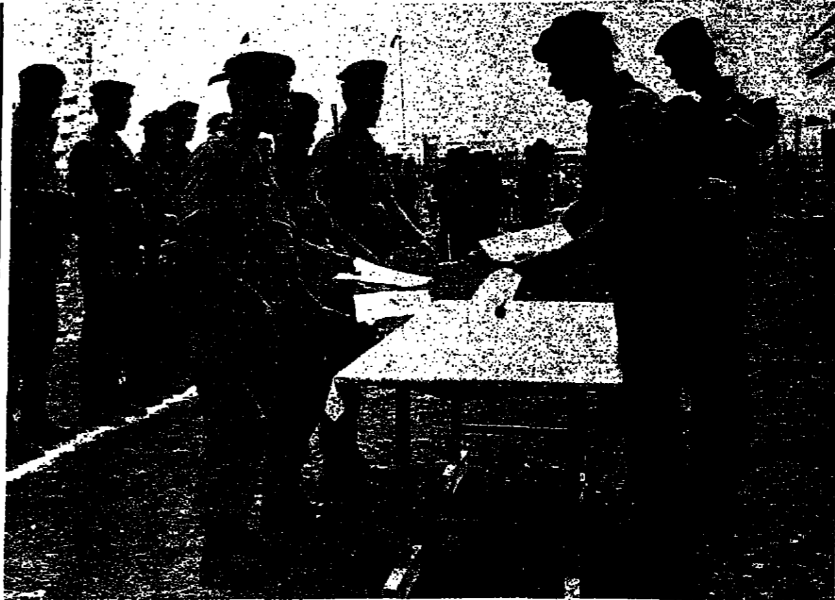
Golan Brigade soldiers are handed certificates on Friday in Eilat marking their participation in the Mt. Hermon-to-Eilat relay run which the group's members held last week.